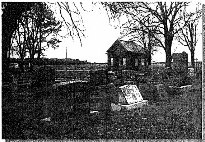
'New cemetery' - Besançon