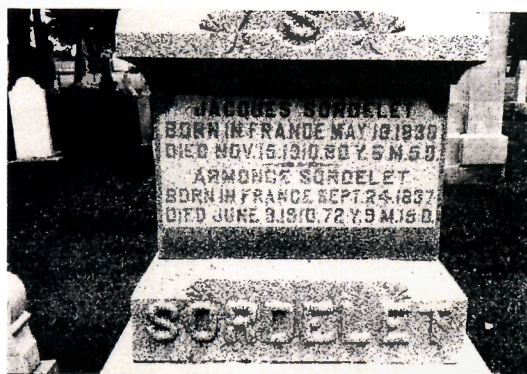
St. Louis Cemetery Besancon, IN