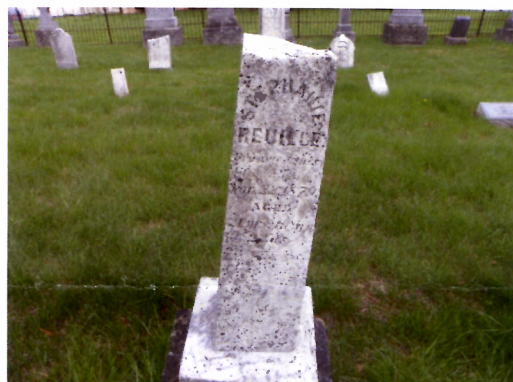
Stephanie Reuille Venderley—"Old" cemetery