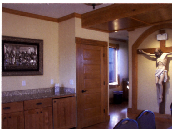
Just entering 1 st floor of St. Agnes Atrium

More pictures of Archives' rooms in future issues of The Chronicles