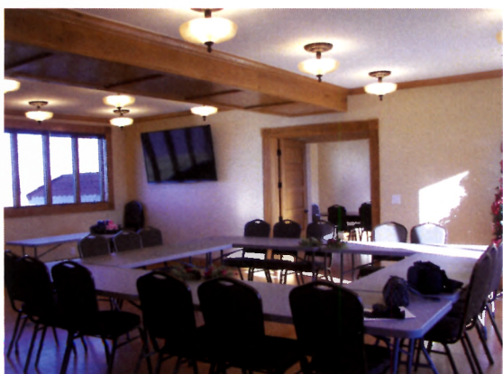
Large 1 st floor meeting room, looking east & into another meeting room