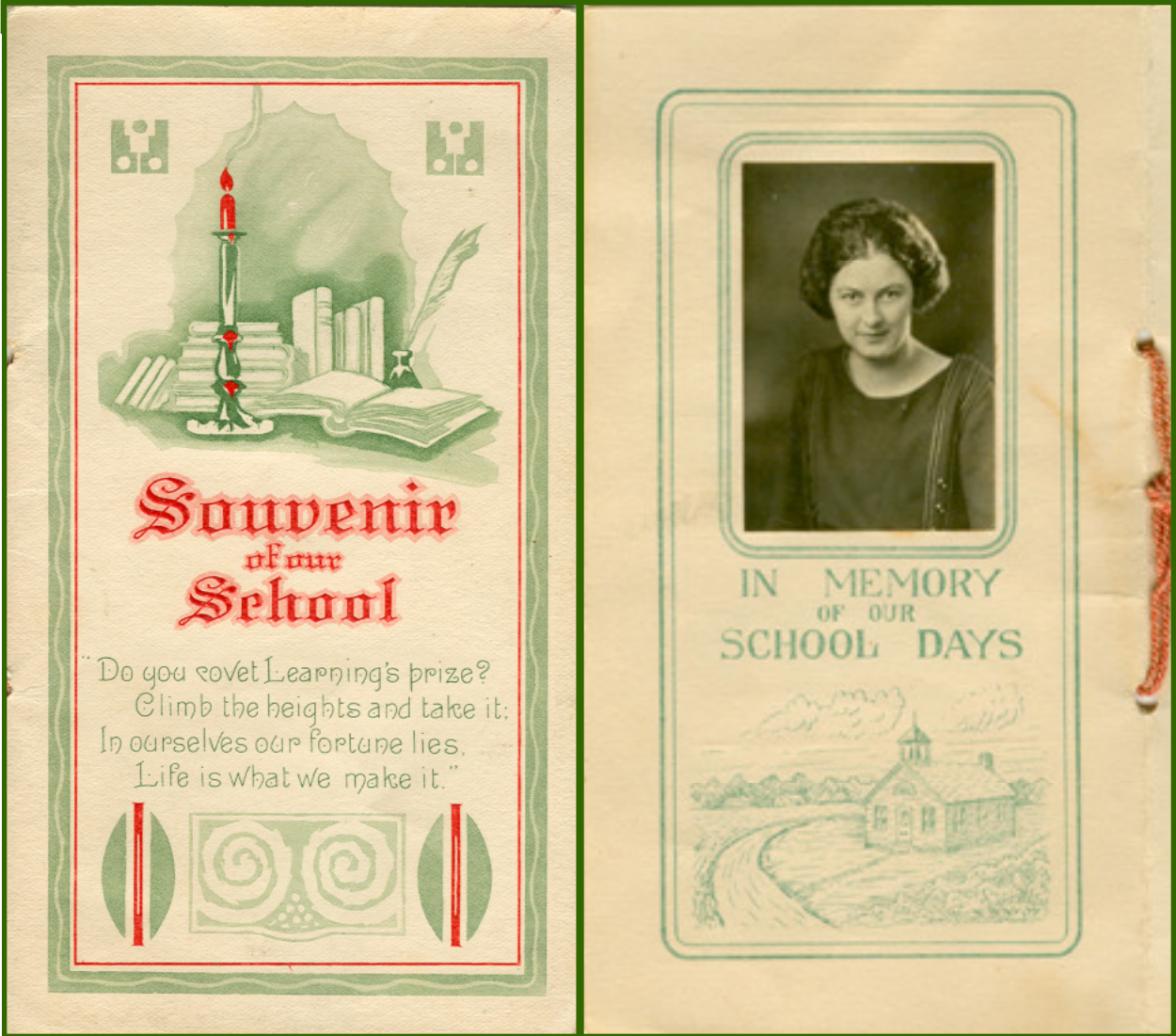
School Souvenir Booklet Collection of Deborah Eidson Records were compiled from this collection in March 2009.